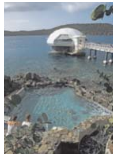
PLACES TO GO, THINGS TO DO Shopping in Charlotte Amalie goes well beyond the routine duty-free fare (top). Above: Coral World.

Next, stop off for a dip in gorgeous Magens Bay, or window-shop for tax-free Rolexes and Armanis in Charlotte Amalie. (Among the new boutiques at Yacht Haven Grande, you can also lunch at W!kked, the island's buzzy new waterside restaurant.) At dinnertime, take a short cab ride to Red Hook and choose from a slew of options: mango sakijitos and green-apple pad Thai at Lotus Asia Grill, say, or the freshest seafood on the deck at Off the Hook. After dinner, one of the island's most stylish lounges is right there at the Ritz — just a moonlit stroll through the garden away from those 400-thread-count sheets. — Ian Keown